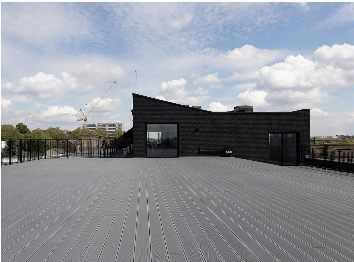
Overview of roof