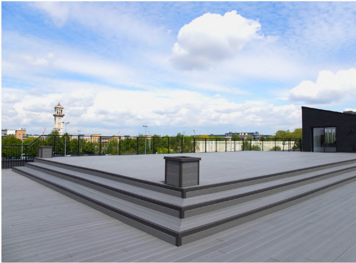
View North East