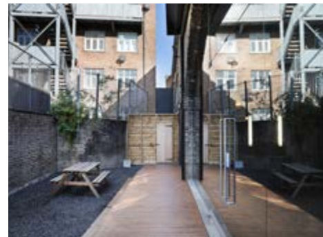
Decked outside area