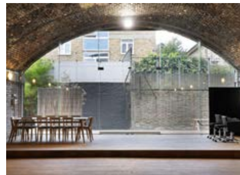
Dining / Hair & Makeup