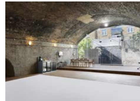
Catering & Dining area