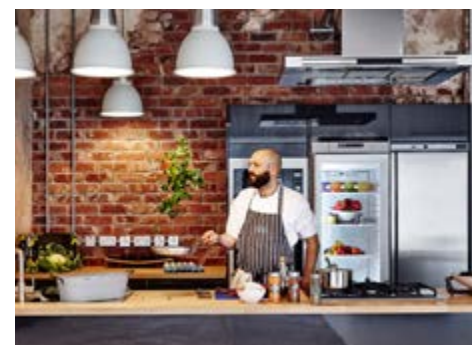
Food styling and prep