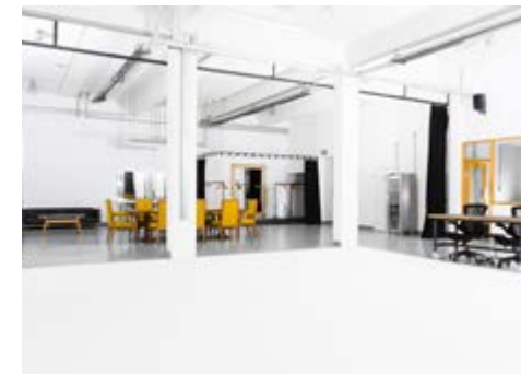
View from cove