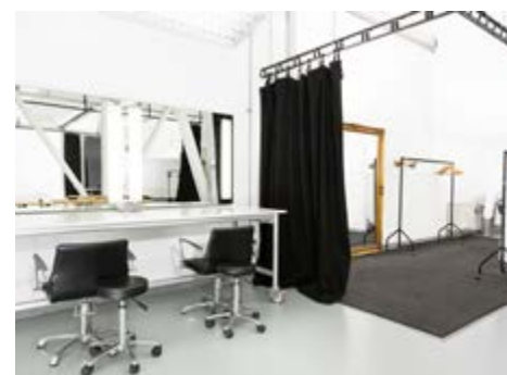
Hair and makeup area