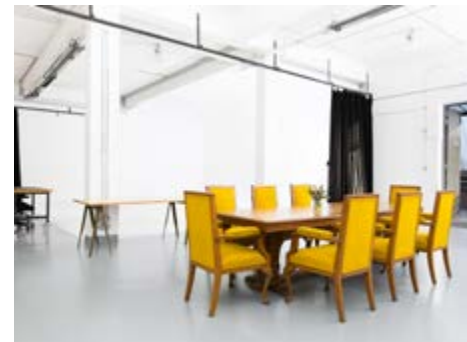
Dining and cove