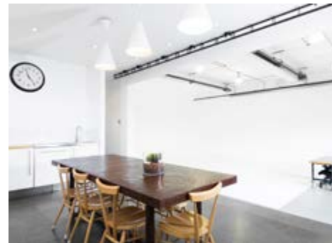
Kitchen and dining