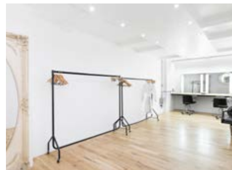
Hair and makeup