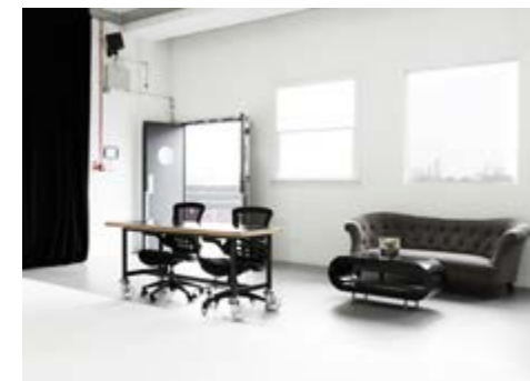
Seating and balcony view