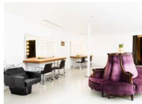
Large hair, makeup and styling room