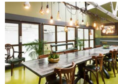
Mezzanine kitchen and dining lounge