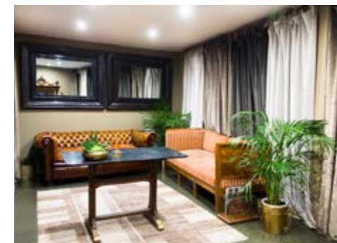
Private talent room