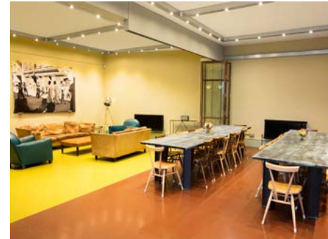
Mezzanine kitchen & dining