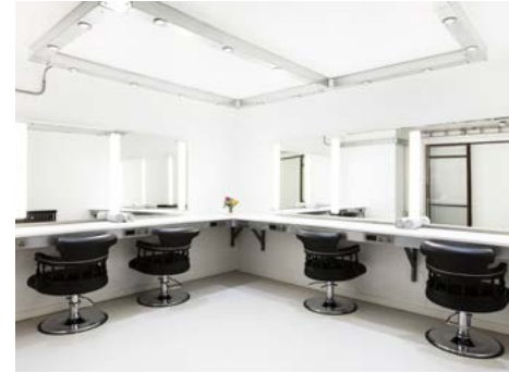
Hair and makeup