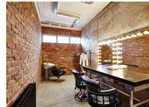
Makeup and Styling