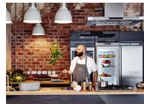
Food styling and prep