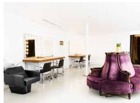
Large hair, makeup and styling room