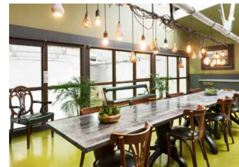
Mezzanine kitchen and dining lounge