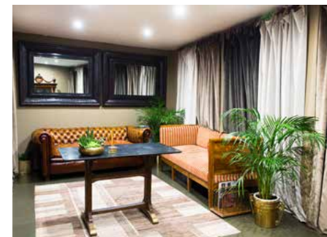
Private talent room