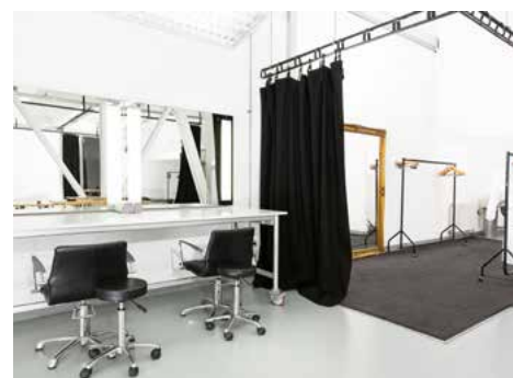
Hair and makeup area