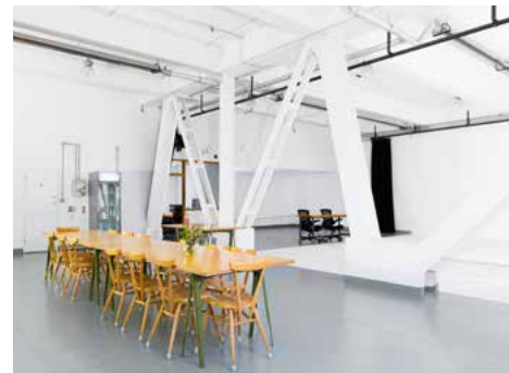
Cove and dining