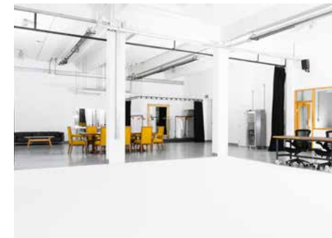
View from cove