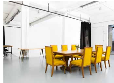
Dining and cove